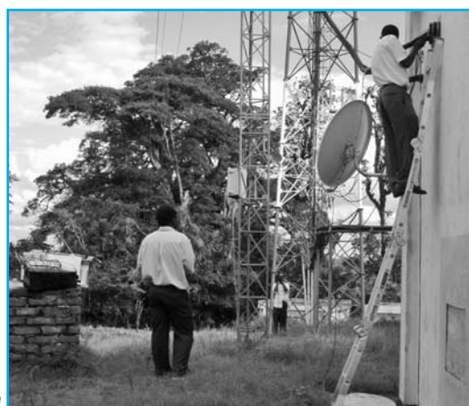
Malawi newly-installed WiFi system

In collaboration with ICTP's Aeronomy and Radiopropagation Laboratory (ARPL), the Department of Electrical Engineering at the Malawi Polytechnic is developing a pilot project to establish a wireless network for telemedicine. The project will involve four institutions in Malawi: the Malawi Polytechnic, Queen Elizabeth Central Hospital, and the Ndirande and Limbe health dispensaries. Regione Friuli Venezia Giulia has generously donated the equipment. Technical experts from Malawi were trained at ICTP's Advanced Training on Wireless Networking in June 2006.