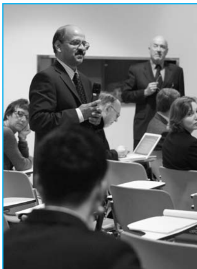
Workshop on Economic Development for Physicists from Developing Countries

Universities, after all, are knowledge, not innovation, centres. Perhaps even more importantly, they are slow to change. The long-standing mandate of universities has centered on two pillars of responsibility: teaching and research. Only recently have universities been encouraged, both by